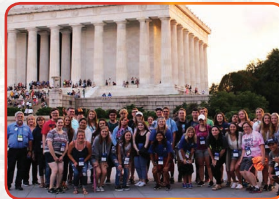
Students in Washington D.C. for the 2016 FRS Youth Tour. Blackfoot sponsored two high school students from our service areas Charlo and Thompson Falls.