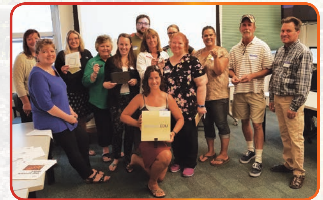
Blackfoot supports teachers during a "Thinking Outside the Box" exercise at the 2016 August Institute. Blackfoot provided scholarships to local teachers to cover their conference fees.